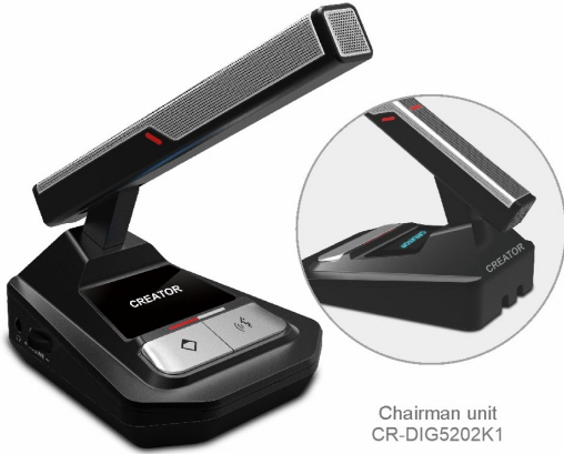
Chairman unit CR-DIG5202K1