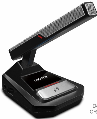
Delegate unit CR-DIG5202K1